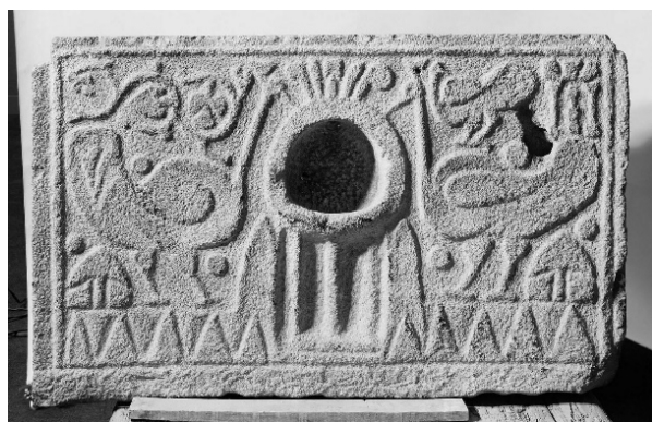
Fig. 2. Depiction of two peacocks facing each other on the front wall of the reliquary surrounding the Chalice (the exit outflow).

On this particular reliquary, the representation of peacocks took the form of two peacocks facing each other. They were accompanied by a variety of other symbols, including crosses, as well as additional motifs like the sun, moon, bird, aedicula (a small shrine-like structure), and a tendril of vine leaves. These symbols were incorporated to enhance the religious significance of the reliquary (as depicted in Fig. 2).