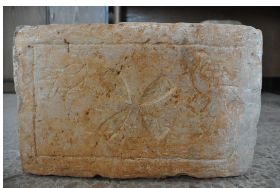
Fig. 6. A sarcophagus reliquary featuring two doves and the four-petal rosette. Currently housed in Masyaf Department of Antiquities.

The second reliquary also follows a similar pattern of decoration, featuring two doves alongside a four-petal rosette. It is possible that these four petals symbolize the four Evangelists, with each petal associated with one of the written gospels. However, it could also serve as a decorative motif without a specific symbolic meaning. These two doves are portrayed with their wings outstretched, encircling the rosette, and facing each other (as shown in Fig. 6).