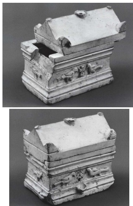
Fig. 5. A reliquary from the 5 th century displaying two doves around the exit outflow. Currently housed in the Menil Collection.

The first reliquary from northern Syria, features a unique representation with two doves facing each other, appearing on both the front and back sides of the reliquary. On the front side, the doves are depicted as if they are drinking from a small basin, symbolizing a baptismal font, which in this context represents the exit outflow. In the center of this depiction, a cross is prominently featured.