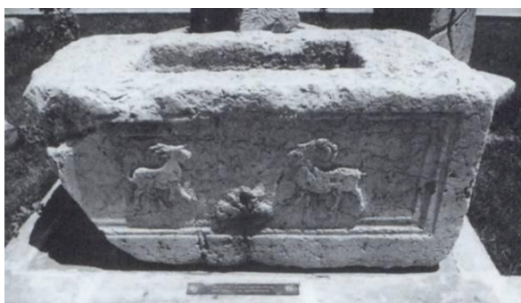
Fig. 4. A sarcophagus reliquary from northern Syria, dating back to the middle of the 6 th century, features two goats facing each other. Currently housed in Şanlıurfa Museum – Inv. No: 6344.

The inclusion of a goat as a symbol on Syrian sarcophagi reliquaries (Fig. 4) carries contrasting meanings within different cultural and religious contexts. The interpretation of goats can vary due to their differing meanings in various cultural and religious contexts. In Christianity, goats are often associated with negative symbolism, representing the cursed or evil person. 14 However, in Jewish tradition, goats hold a different significance, symbolizing sacrifice. 15