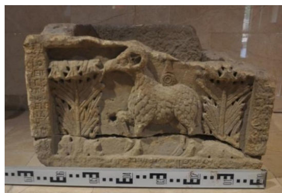
Fig. 3. Representation of the ram and the acanthus leaves on a sarcophagus reliquary from the early 6 th century. Currently housed in Sivas Museum – Inv. No: 309.

The depiction of a ram on sarcophagi indeed carries a significant symbolism, which can represent the idea of the saints offering their lives as a sacrifice for their faith, mirroring Christ's sacrifice, and bearing witness to it. The use of a scroll carried by the ram on his back, as found on one of the sarcophagi from northern Syria, adds another layer of meaning. While it may not be entirely clear what the ram is holding, it is reasonable to assume that it represents a scroll, which symbolizes the written word of God or the teachings of Christ. This connection underscores the importance of faith, divine guidance, and the spiritual significance of the saints within the Christian tradition, making the ram a potent symbol on these reliquaries. 12 (Fig. 3).