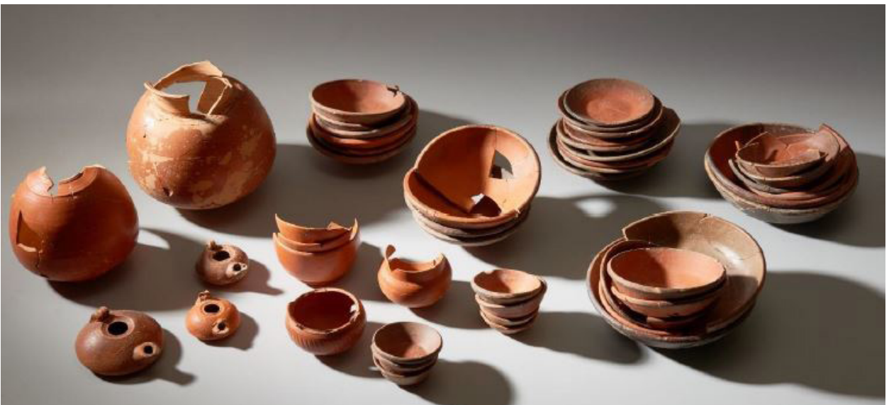
Fig 2. Finds belonging to the "final banquet scene" encountered in the Association Building: denarius struck in name of Marcus Aurelius (figure 2.1.) and a sample of the ceramic finds found in the concentrations of the different rooms (figure 2.2.).

unguentaria were encountered as grave goods. 121