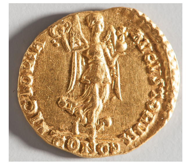
Fig 3. Tremissis struck in name of Theodosius I, found at Sagalassos.

The above paragraphs showed that the concrete evidence for large payments at Sagalassos. First, the epigraphical and historical record gives information about considerable sums that were paid, i.e. in the context of the financing of public amenities, for the settling of fines, or for religious offerings or money distributions. Moreover, the sums that are recorded for the Roman period are expressed in terms of precious metal coins. Second, the excavations at Sagalassos yielded a number of precious metal coins dating to the Roman period, i.e. 9 silver and 1 gold specimens. At first sight, there is a clear discrepancy between these two categories of evidence. On the one hand, the epigraphical and historical attestations mention large sums of money, i.e. up to 30.500 denarii at Sagalassos during the Roman period, while on the other hand the presence of precious metal coins that could be used to fulfil these payments is very limited. Such scarcity of precious metal coins in archaeological excavations is a general phenomenon: At Perge for instance, the 1910 recorded coin finds included only 9 Roman denarii dating between the reign of Domitian and Severus Alexander and no Roman gold coins at all. 126