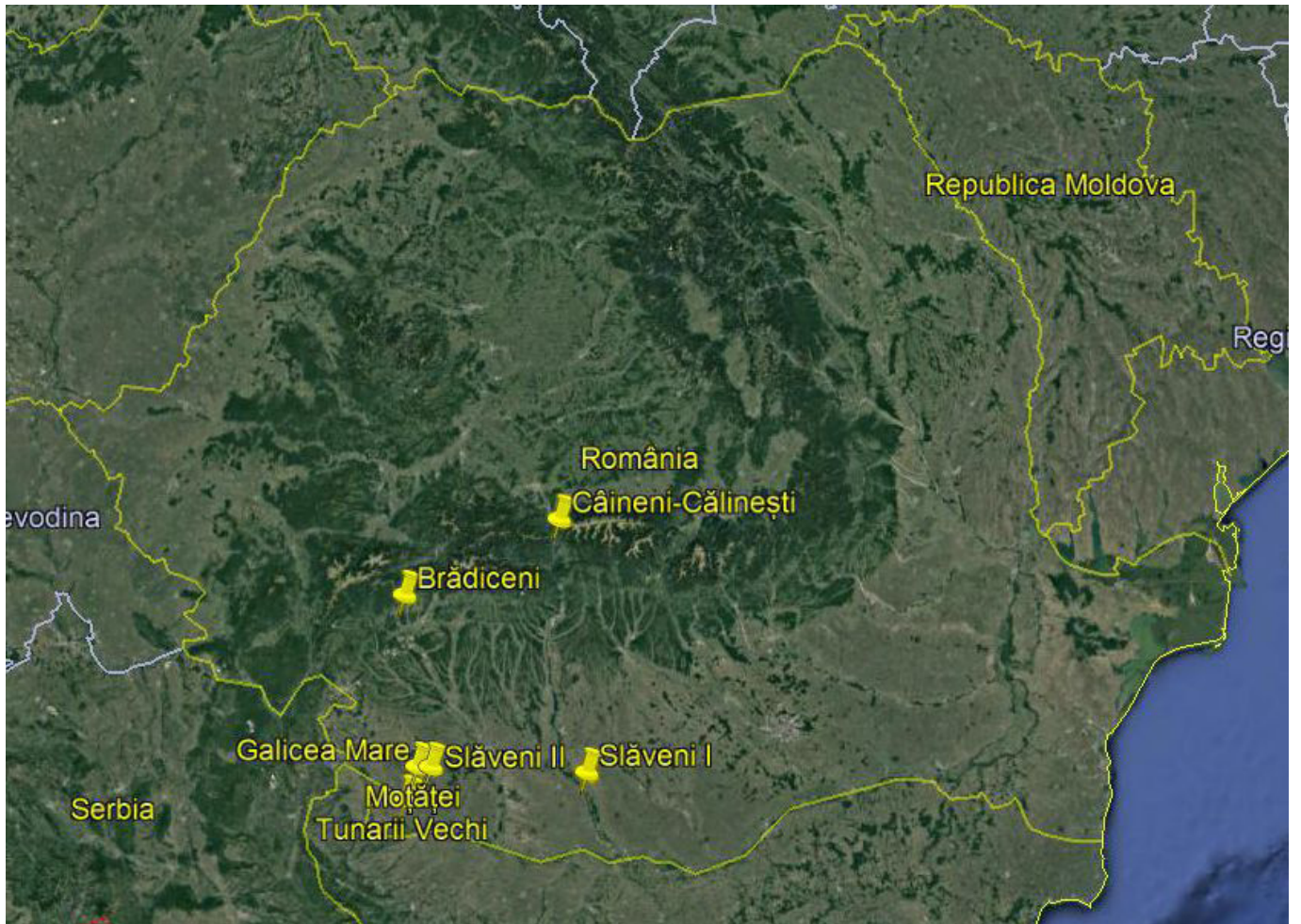
Map of hoards from the former territory of Dacia (broadly, nowadays, Romania) ending with coins from Philip I.