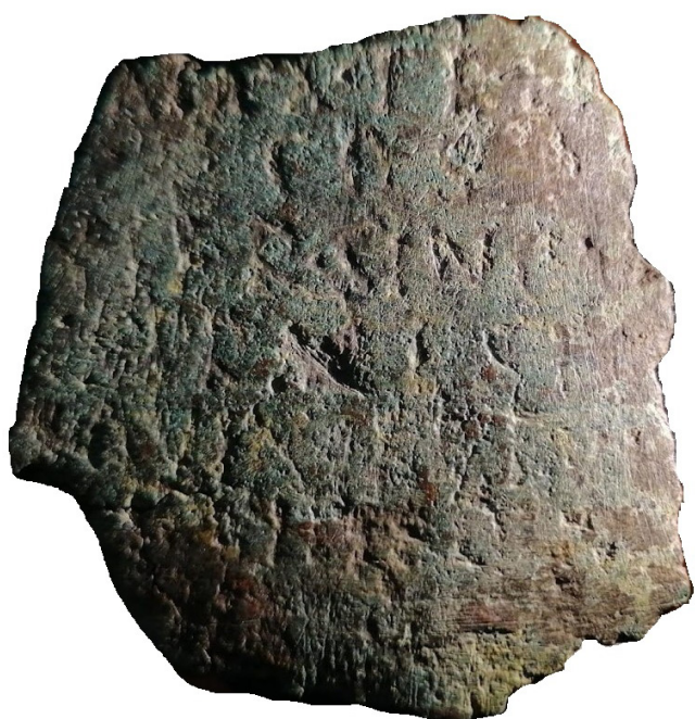
Inner face: traces of 6 lines of text (Fig. 2).