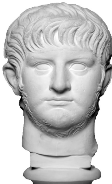
Fig. 2. Nero, Portrait type 3, Rome Museo Palatino (After Bergmann)