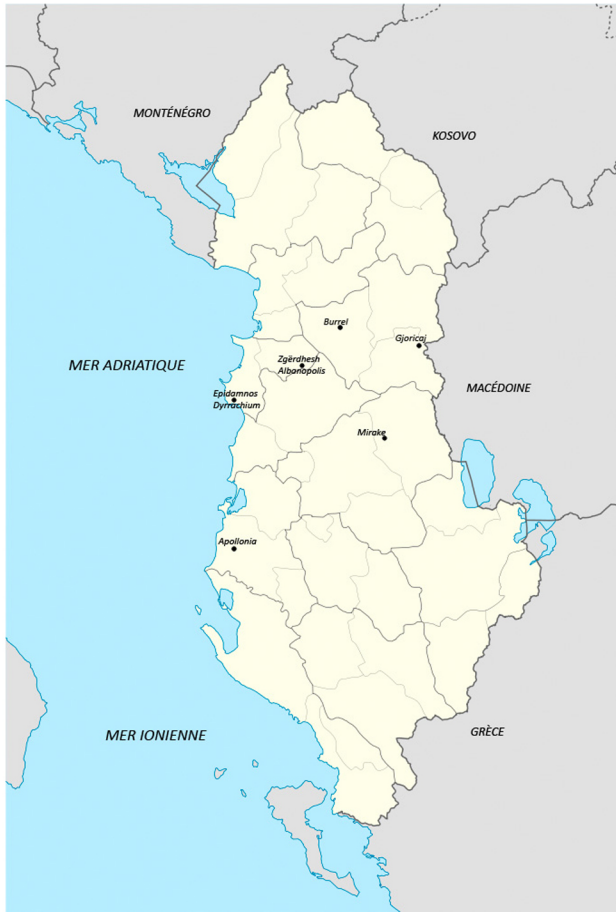
Fig. 1. Map of distribution