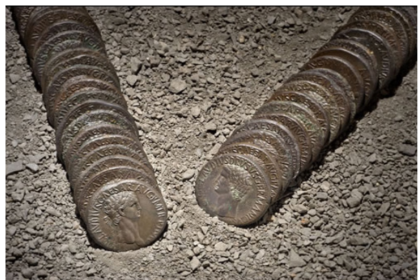
Fig. 3. Part of La Pobla de Mafumet hoard with coins superposed in cartridges, formed into sachets of linen or fabric. With this way the coins were transported from Rome to the Iberian Peninsula.

With Hispania fully subdued and after the closure of the Hispanic mints 31 , possibly at the end of Caligula's reign (and where we have not documented hoards), the Hispanic coin supply was insufficient from Rome. Imitative and Claudian coins were struck by an undetermined number of emerging Hispanic mints. Tarraco was precisely the place where it was suggested that there was a mint at the beginning of the Claudian reign. This idea underlies of the hoard found in La Pobla de Mafumet (Tarragona) (Tab. no. 14) (Fig. 3), originally buried of 250 sestertii and dupondii of Claudius I, which were transported by means of several cloth cartridges inside a Roman amphora. It is the largest known Hispanic hoard of official coins, and should be interpreted as money sent directly from Rome and not from monetary circulation 32 . During the reign of Claudius I, the Tarraconensis was conceived as both an importer and distributor of official bronze coins in order to satisfy the Hispania's demand. Sometimes differentiating the official coin with regard to the imitative is a complex and subjective task; so many hoards