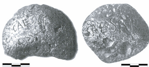
Fig. 1. The two round silver ingots with the word caesar incised (García-Bellido 2004, 75).

contained about 5,000 coins, between Republicans and some Imperials denarii. Next to the denarii also 9 round silver ingots were found (and 2 of them with the word CAESAR incised). Although a third of the hoard was quickly dispersed on the market, only 3,481 denarii could be documented 10 . In this hoard emphasizes powerfully the absence of the pretended Hispanic military denarii of Emerita Augusta , Caesar Augusta and Colonia Patricia ( Emerita , struck by P. Carisius, 'Uncertain mint 1' and 'Uncertain mint 2' catalogued in RIC I 2 respectively). The hoard was buried before that those mints came into activity, which brings us to a date quite close to that of the most recent coins, RIC I 2 543a type, with shield or caetra , dated during the years 31-27 B.C. Likely this last one coinage be Hispanic and related with the bronze coinage from the Hispanic northwest or " Lucus Augusti " (RPC I 1-4). The round silver ingots of Alvarelhos hoard (Fig. 1) maybe are local silver or a tribute of Hispanic natives to the Roman army. The original weights of the silver ingots were not individualized and we have only the total: 3,228.2 g, so each piece had a weight of 358,66 g. Two of them are signed with CAESAR, and surely it is silver ready to be struck by the roman army, perhaps the denarii with caetra 11 , though it is pure lucubration.