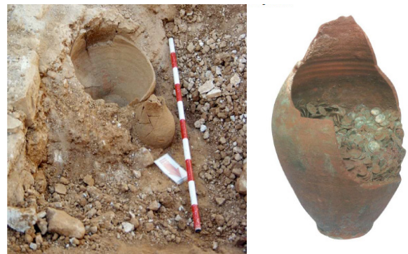
Fig. 7. Lliria hoard and the ceramic vessel (Delegido Morant 2014, 8-9).

Some archeological materials associated, as scapus , lanx and aequipondium , were found in archaeological level of abandonment. These materials, which formed a Roman scale, have been linked to the hoard. The main use