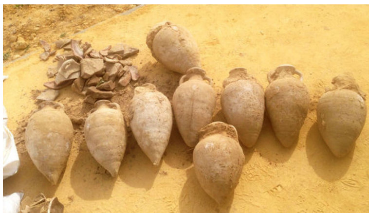
Fig. 10. Some amphorae from Tomares hoard.

approximately contemporary with the Edict on Maximum Prices of Diocletian (AD 301), brought with them a firm intention in order to reform the tax system and stabilize a new bronze coin ( nummus ) 80 . When reviewing the post-reform reigns of Diocletian to Maximinus II Daia (c. AD 294-313), it is of obligatory character to mention the recent hoard from El Zaudín (Tomares, Seville) (Tab. no. 37), discovered in 2016. It is composed of more than 50,000 tetrarchic nummi, distributed in the interior of 19 Dressel 23-type amphorae from the Guadalquivir Valley, which were used for the transport of Baetican oil (Fig. 10). Due to the number of coins it contained, the Tomares hoard is taken as a European reference, not only because of the amount itself, but also because of the strange circumstances that surrounded its finding.