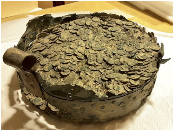
Fig. 8. Valsadornín hoard.

kg, equivalent to more than 10,000 or 20,000 coins, although only 2,421 antoniniani were documented. This large amount of antoniniani inside an everyday container suggests that it is a private savings and hidden unexpectedly by a rich Hispanic family.