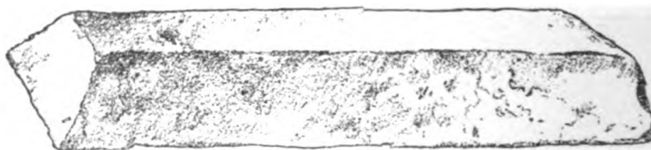
Fig. 6. Gold ingot from Pajar de Artillo hoard (Willers 1902, 38).

of Italica or that it is simply some monetary endowment sent from Rome. This hoard denotes that fortunes or mobile patrimonies were not necessarily coins.