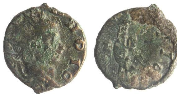
Fig. 9. Hispanic antoniniani (?) from Cortijo de Acevedo hoard. With cast bronze stems and metal inlet and outlet debris (Carcedo Rozada/García Carretero/Martín Ruiz 2007, 39).

Divo Claudio coins 71 . This hoard was found in the forum of Regina Turdulorum (Casas de Reina, Badajoz) (Tab. no. 35), during the 1986 excavations. The coins were located next to a fibula - with an uncertain and late chronology, perhaps of the 3rd century AD - that probably closed the cloth or leather pouch. Its composition is strange among Hispanic hoards. For some unknown reason, the coins were selected and perhaps removed from circulation 72 . Despite Aurelian's reform of 274 AD 73 , the imitative minimi continued to be minted, probably locally and supplying the serious shortage of official currency.