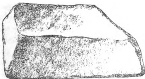
Fig. 5. One of the silver ingots from Pajar de Artillo hoard (Willers 1902, 39).

aurei hoard found in Trujillo (Cáceres) and composed of more than 1,700 aurei (around 6 kg of gold) 45 . In the absence of a study, little more is known about this second hoard, although it seems reasonable to frame it in the golden age of the Antonines, as can be seen from the Braga's hoard already mentioned. From same horizon can be the hoards of Constantina (Seville) 46 (Tab. no. 23), buried with 47 aurei, and the Pajar de Artillo ( Italica , Santiponce, Seville) 47 (Tab. no. 24), with 144 aurei, 2 silver ingots (each with a weight of 3.80 kg, and 1 gold ingot of 3.70 kg (Figs. 5 and 6). In this last hoard the original number of aurei amounted to 1,500 and only 144 aurei could be recorded, the most recent struck by Marcus Aurelius. It is must be insisted that the Pajar de Artillo hoard is part of some important payment or tax made in the city