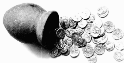
Fig. 2. Ampurias hoard with the vase of grey ceramic (Keay 1998, 166).

republican denarii. Judging by the number of coins, it could be an aerarium militare and used for the pay of soldiers, but the death of the responsible, perhaps in military maneuver of the Hispanic Northwest during the Astur-Cantabrian Wars (29-19 B.C.), perhaps along with the entire detachment, caused their loss in the Galician castro. Polibius 12 narrates that a Roman infantryman was paid with 2 oboli for day (6 oboli correspond to 1 denarius), i.e. 1 denarius every three days, from which food and clothing are deducted 13 . Assuming that the Alvarelhos hoard was originally formed with more than 5,000 denarii, the aerarium militare could have covered the monthly payments of a detachment for some maneuver warfare. Following these data and as Villaronga pointed out, it is estimated that the annual salary of the legionnaire was approximately 225 denarii 14 , as a result of the Augustan hoard of denarii found in Cerro Casal (Utrera, Seville) (Tab. no. 2). Certainly, this last hoard seems is related with roman merchants in Baetica and not with soldiers. The absence of Iberian denarii in Alvarelhos hoard contrasts with other hoards. For example, we can cite the Ampurias hoard (Tab. no. 3), found during the archaeological excavations of the current parking lot (south of Neapolis). It is a hoard of 89 denarii buried inside of an Ampuritan grey vase (Fig. 2) and its context is associated with the last construction phase from Ampurias neapolis.