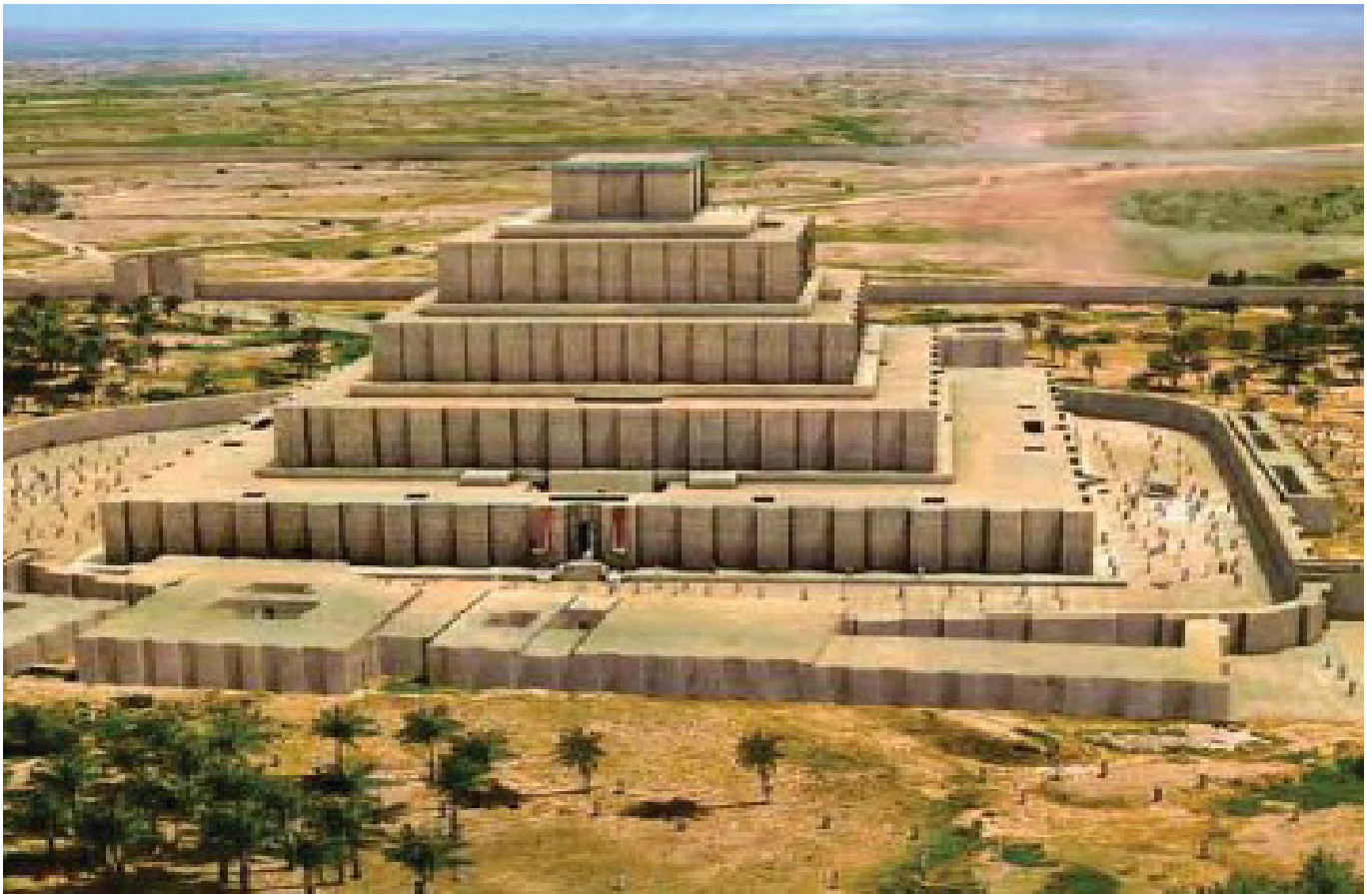
Fig. 1. Reconstructed Image of Chogha Zanbil Ziggurat 19