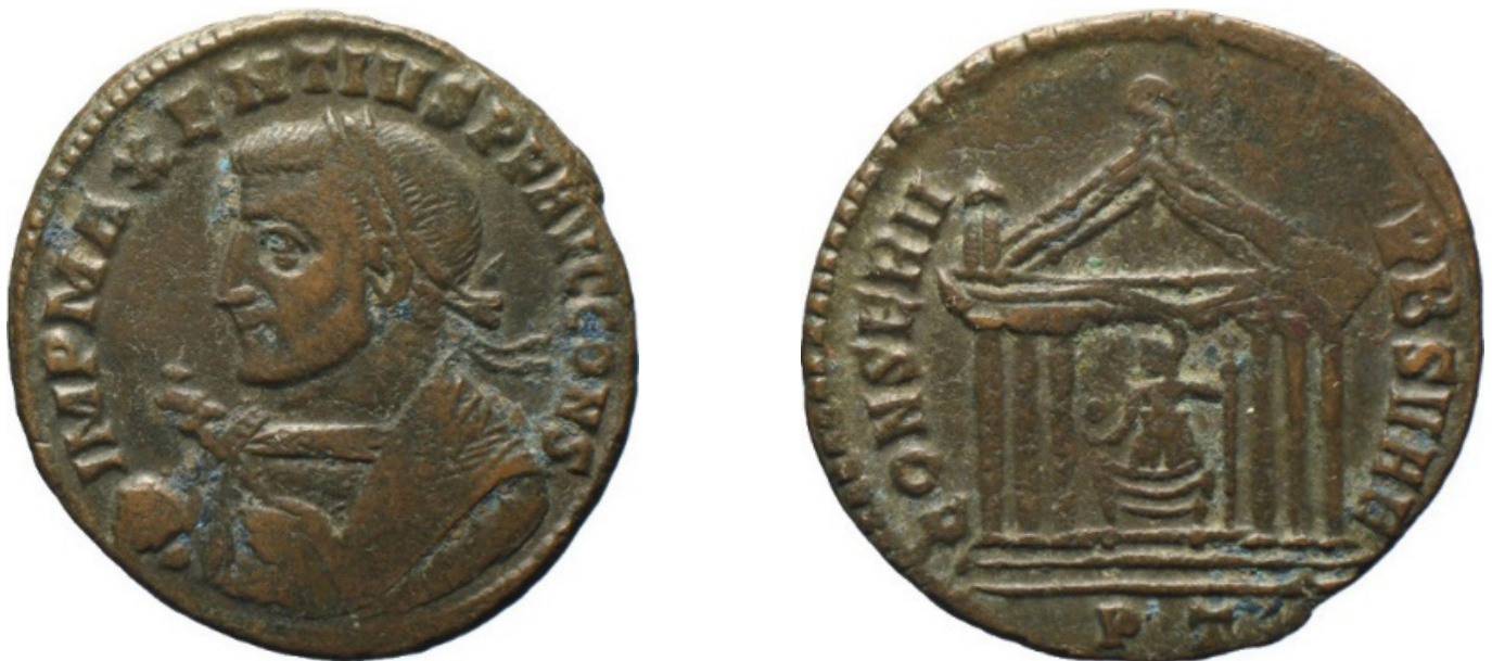
Fig. 2. Bronze coin, RIC VI Ticinum 103 (308-310), depicting laureate head of Maxentius with eagle-tipped sceptre on the obverse (legend: IMP MAXENTIVS P F AVG CONS), and Roma seated in temple, holding globe and sceptre on the reverse (legend: CONSERV VRB SVAE).

that adorned the reverses of Maxentius' coins included the goddess Roma, the lupa romana , and Castor and Pollux. There was also a prominent place in Maxentian ideology for Mars (Fig. 1), who was also intrinsically linked with the city of Rome. 11 With the exception of the latter, all of these figures found little to no resonance on Tetrarchic coinage, thus fitting the sentiment that had allowed Maxentius to come forward as champion of the Roman cause.