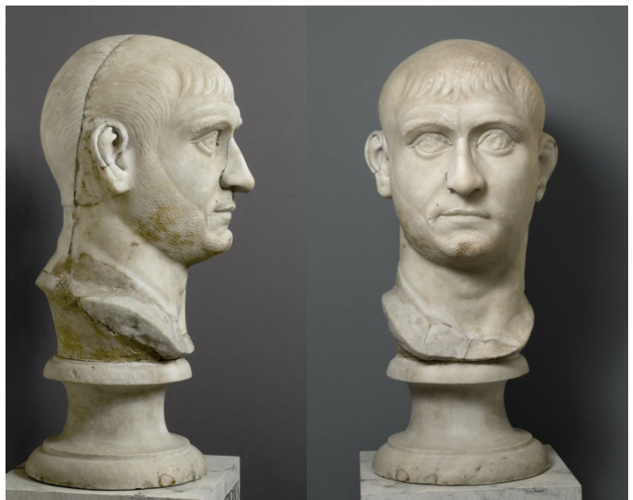
Fig. 6. Portrait of Maxentius. Stockholm, National Museum, inv. no. 106.