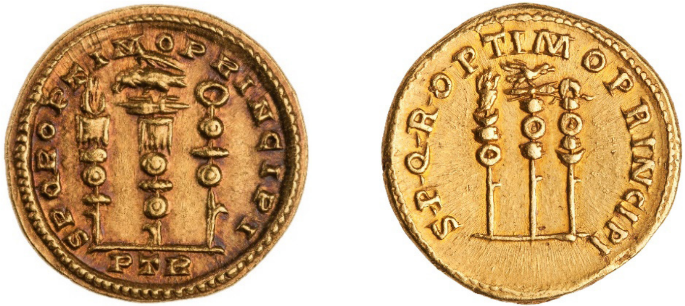
Fig. 10. Reverse of solidus of Constantine (left: RIC vi Treveri 815) and aureus of Trajan (right: RIC ii Trajan 296), both depicting a legionary eagle flanked by two standards with the legend SPQR OPTIMO PRINCIPI.

The sudden appearance of an optimus princeps must therefore have been noticed by his former subjects. Such word play was not exceptional to the anti-Maxentian policy in Rome that followed Constantine's victory. 116 As a matter of fact, the Trajanic imitations were not the only types that seem to have been limited to the former Maxentian mints. There were also the types that played upon Maxentius' conservator types by pairing an identical reverse image of Roma with legends speaking of Constantine as restitutor or liberator urbis suae , which neatly fitted the Constantinian portrayal of Maxentius' rule as an age of tyranny. 117 The construction ' urbis suae ' had been unseen in Roman imperial coinage before Maxentius, so there can be little doubt that these legends were indeed attempts by Constantine and his associates to turn Maxentius' ideology on its head. 118 Liberator urbis would later even be translated in stone on the Arch of Constantine, interestingly enough being paired with Trajanic spolia . 119