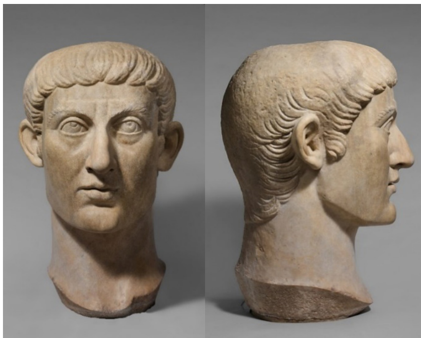
Fig. 8. Portrait of Constantine. New York, Metropolitan Museum of Art, inv. no. 26.229.