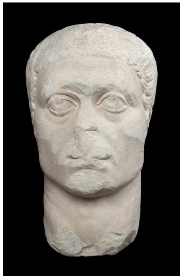
Fig. 9. Portrait of Constantine. Rome, Mercati di Traiano, inv. no. FT 10337.

may have facilitated the newly forged connection between Constantine and the Trajanic title of optimus princeps , yet the main reason is likely to be sought in the regained topicality of the princeps title under Maxentius.