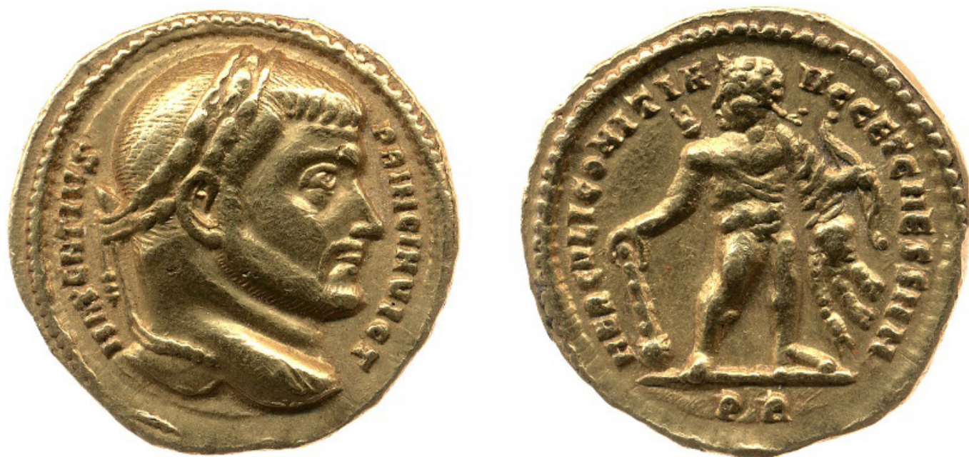
Fig. 3. Gold coin, RIC VI Rome 147 (307), depicting laureate head of Maxentius (legend: MAXENTIVS PRINC INVICT), and Hercules standing, leaning on club, holding bow in left hand (legend: HERCVLI COMITI AVGG ET CASS NN).

subsequently commemorating this feat on his coinage, Maxentius highlighted his connection with the city of Rome and its traditions. 15 To those handling the coins it thus must have been clear that it was the new augustus Maxentius who made sure that Rome would prosper and its traditions would be preserved as long as he ruled. 16