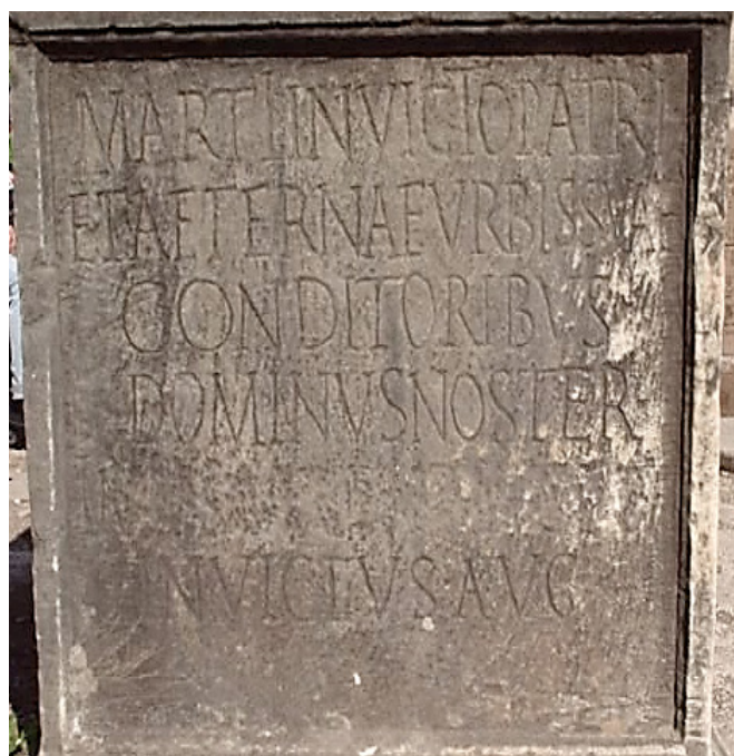
Fig. 7. CIL vi, 33856a.

unconquered Augustus (dedicates this statue). 77