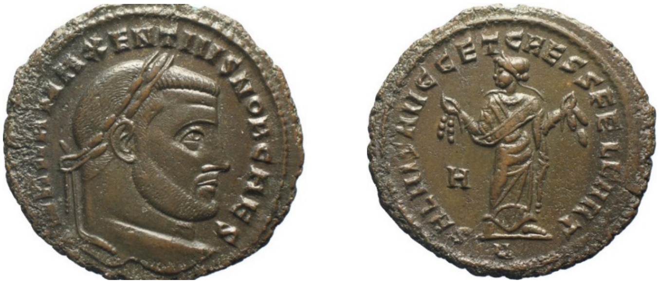
Fig. 4. Bronze coin, RIC VI Carthage 51a (306), depicting laureate head of Maxentius (legend: M VR MAXENTIVS NOB CAES), and personification of Carthage standing in long robe, holding fruits in both hands (legend: SALVIS AVGG ET CAESS FEL KART).

of princeps invictus Maxentius. 49 This double use of the title may well have effected a degree of confusion. It may have led the Carthaginians to believe that the princeps title that was attached to the name of Maxentius was meant as a way of referring to the more common princeps iuventutis . Its actual meaning as a reference to the delicate balance of power may have been clear to the receiving end in Rome itself, to whom the princeps title was likely to have been primarily directed, but this was different for the people inhabiting the African littoral. With the winter as a possible complicating factor for sailing and, by extension, for communications between Italy and Africa, the Carthaginians may have been left without such detailed knowledge at the early stages of the Maxentius' rule, thus basing themselves at the available coinage instead. 50