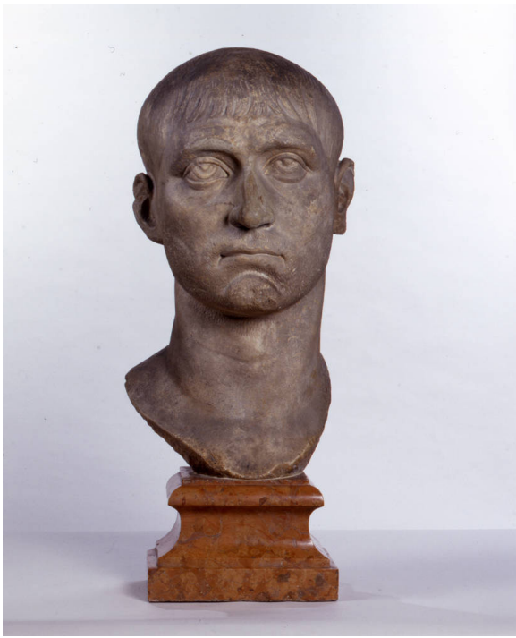
Fig. 5: Dresden, Staatliche Kunstsammlungen, Skulpturensammlung, inv. no. Hm 406.

accentuated eyes (Fig. 5). These were conventional features of imperial portraiture at the time, as they were common aspects of Tetrarchic portraiture. Unconventional, however, are the comma-shaped locks on the forehead of his sculpted and minted portraits. 73 These mirror the hairstyles of the Julio-Claudian emperors and especially the style of Trajan. The crown and side hair of the sculpted examples likewise seem to have been modeled in likeness to earlier emperors. Trajan, once again, served as the prime example, as becomes apparent from the Stockholm head for example. (Fig. 6). Furthermore, the working of the heads, particularly the cuts on the back of the head from Dresden, suggest that all but one of Maxentius' surviving portraits were made to be set into togati capite velato – the traditional way in which the early emperors expressed their role as princeps . 74 The toga would have presented Maxentius in the traditional senatorial attire, whereas the capite velato would highlight his pietas , mirroring famous depictions of the emperor such as that of Augustus on the Ara Pacis .