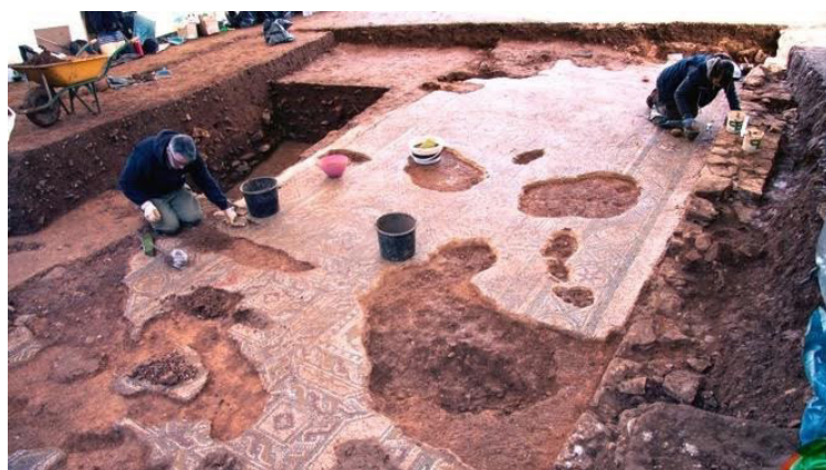
Fig. 2. Works in the mosaic of the villa of Andallón in the 2020 campaign.

at least three plausible – and not exclusive – hypotheses can be drawn about the identity of the owners. In the first place, and in the absence of a stable and profuse network of cities present in other peninsular areas, it is very possible that certain Roman officials who moved to the Cantabrian area after the conquest, and who were responsible for the exploitation of the mining resources, established themselves in villae , and developed typically Roman production models.